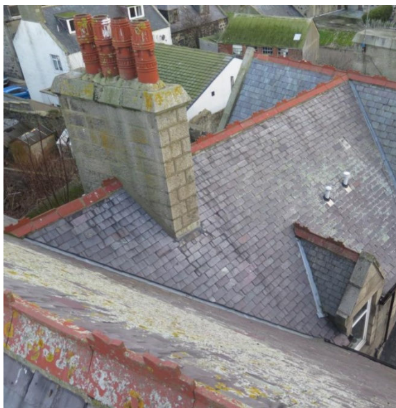
Poor apical tile mortaring and cracked mortar at the chimney haunches, letting in water.