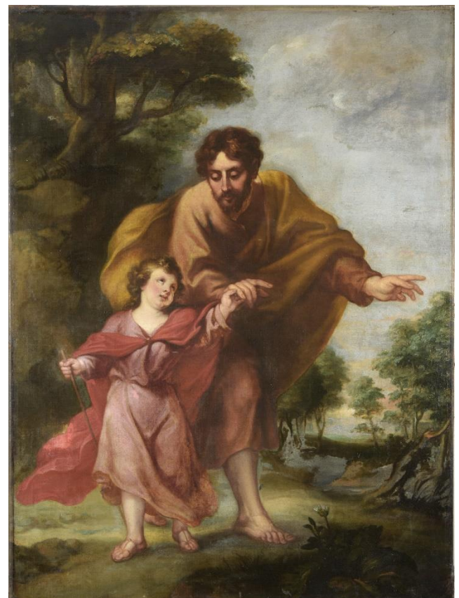
Bartolome Esteban Murillo (1617-1682), "Walk of St. Joseph and the Child of Christ".

In this vein, I like to refer to St. Joseph the words of the prophet Isaiah, when he asks, "Who of us can dwell with the consuming fire? Who of us can dwell with everlasting burning?" (33:14). Consuming fires and everlasting burnings were and are the Hearts of Jesus and Mary. Having been formed by the power of the Holy Spirit, these